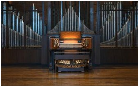
Casavant organ, Gill Chapel, Rider University, Lawrenceville, New Jersey